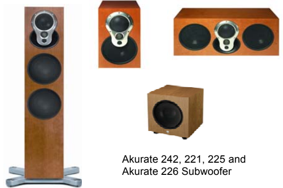
Akurate 242, 221, 225 and Akurate 226 Subwoofer

The Akurate 221 subwoofer has been discontinued and replaced with the larger Akurate 226 Subwoofer