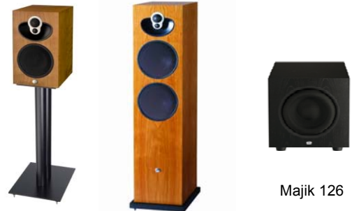
Majik 109 on stand

The Majik 126 is almost identical to the old Sizmik but has improved amplification and driver.