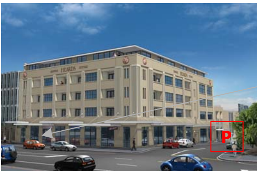
The Demo Room

We will keep you up to date with info prior to the opening.